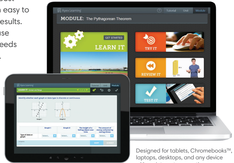
Designed for tablets, Chromebooks™, laptops, desktops, and any device with an Internet connection.

Adaptive remediation down to elementary-level content