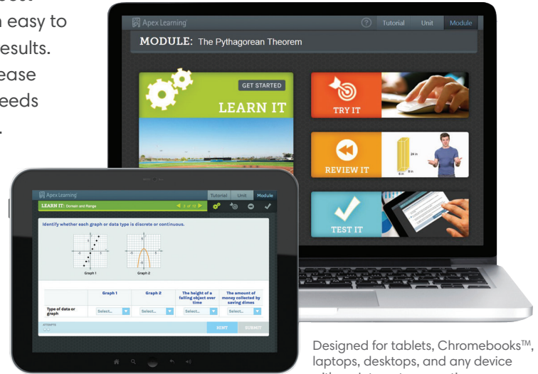
Designed for tablets, Chromebooks™, laptops, desktops, and any device with an Internet connection.

Graduate all students college- and career-ready. College and career readiness Tutorials prepare students for college entrance and high school equivalency exams by giving students the focused support they need to excel.